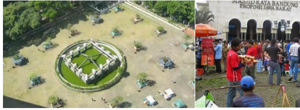
Figure 2: Concrete floor of Alun-alun in 2007 (left); Informal street vendors took over Alun-alun (right) 9) .

The pots for trees and pool removed from the central part of Alun-alun. Approximately 4.300 sqm of central part of Alun-alun is covered by synthetic grass because of maintenance issue. It has a very interesting green pattern. The orientation of this part also respecting The Great Mosque of West Java Province that located in West. It intended to be extension space for praying during important religious holiday. The physical barrier of different elevation and fences around Alun-alun also removed to create more accessibility for visitors.