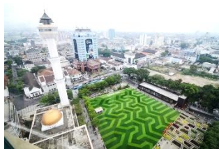
Figure 3: New Alun-alun 10)

Public library also provided in the East part of Alun-alun. It provides space for visitors as an alternative for outdoor activity. To gain more knowledge, especially about Bandung from books that provided inside the public library. The purpose of this space also to increase reading interest and reduce number of illiteracies that happen in Bandung.