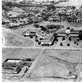
Figure 7: Aerial view of Tjilakiplein 14)

Total area of this park is 800 sqm. The new intervention removed of the fences while still keep some part of it due to keep the animal inside the park and add landscape furnitures. It has several facilities for both people and animals such as park bench, wifi, trash bin, jogging track, and animal playground. To make concept of Pet Park stronger, the landscape furniture designed to looks like animal, for instance, park bench that looks like a rabbit, public cupboard colored white with random black dots to looks like a cow or dalmatian, and statue of human and dogs that represent strong bond between animal and human.