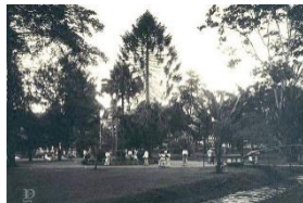
Figure 1: Stijhoff Park 1933 4)

Afterwards, Bandung had several development, such as adding new transportation lanes, construction of education facilities, improvement of housing and city quality, relocation of European and Chinese cemeteries, building new market, and horse facilities 3) .