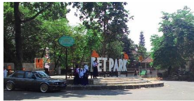
Figure 8: Pet Park entrance area 15) .

Total area of this park is 800 sqm. The new intervention removed of the fences while still keep some part of it due to keep the animal inside the park and add landscape furnitures. It has several facilities for both people and animals such as park bench, wifi, trash bin, jogging track, and animal playground. To make concept of Pet Park stronger, the landscape furniture designed to looks like animal, for instance, park bench that looks like a rabbit, public cupboard colored white with random black dots to looks like a cow or dalmatian, and statue of human and dogs that represent strong bond between animal and human.