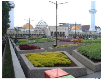
Figure 5: Flower Labyrinth 12)