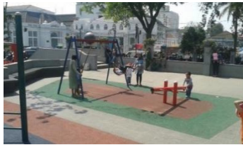
Figure 6: Kids Playground 13)

Furthermore, the cleaner condition of Alun-alun happens because of efforts by the mayor to regain the conscious of citizen to dispose trash in its place by providing proper trash bin, updating city regulation that related with littering, and massive clean campaign in schools and offices. It is also because the informal street vendors are no longer allowed to occupy the main area that usually contributes to littering in Alun-alun. They relocated in enovated basement area. The renovated basement has well ventilation to access outside fresh air and also let sunlight enter. It is a strategic place for them to sell their goods because they will be the first and the last to see by potential customers who park their car in the basement. It is increasing the opportunity for customer to buying their goods.