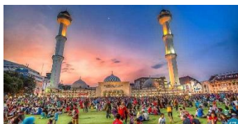
Figure 4: Vast Open Square 11) .